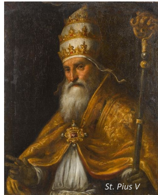
St. Pius V